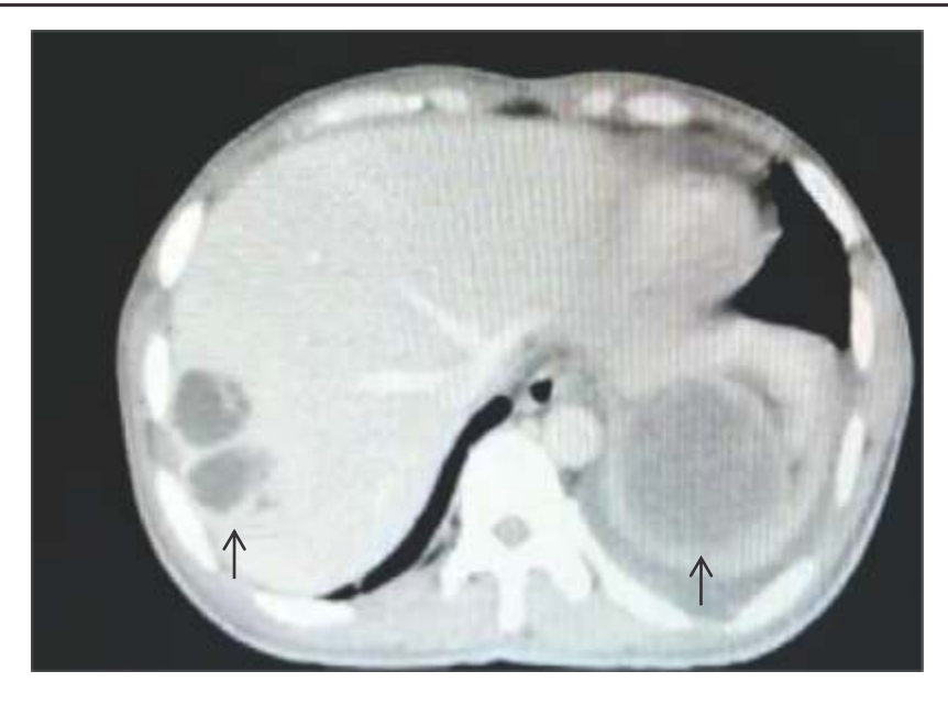
Figure 2: Multiple hepatic and splenic abscesses seen on contrast enhanced computed tomography